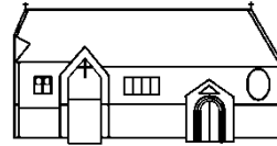
St Michael's, Woolmer Green